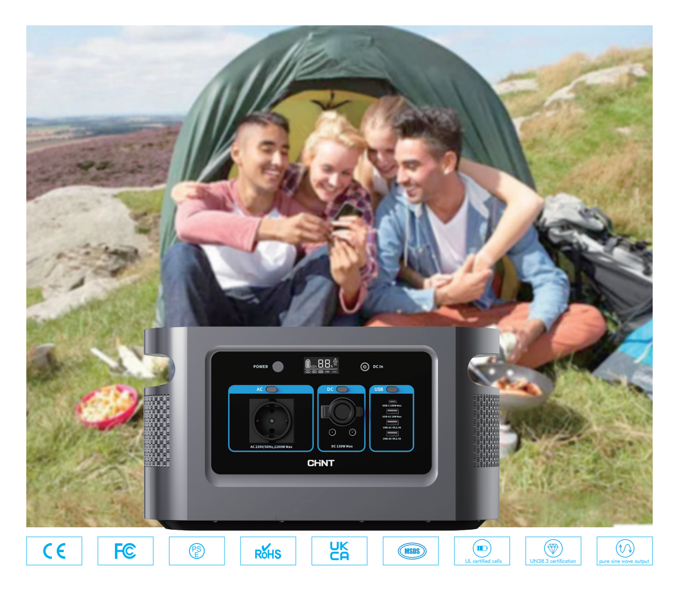
1. Applicable To Multiple Scenarios