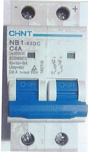
Images of NB1-63DC