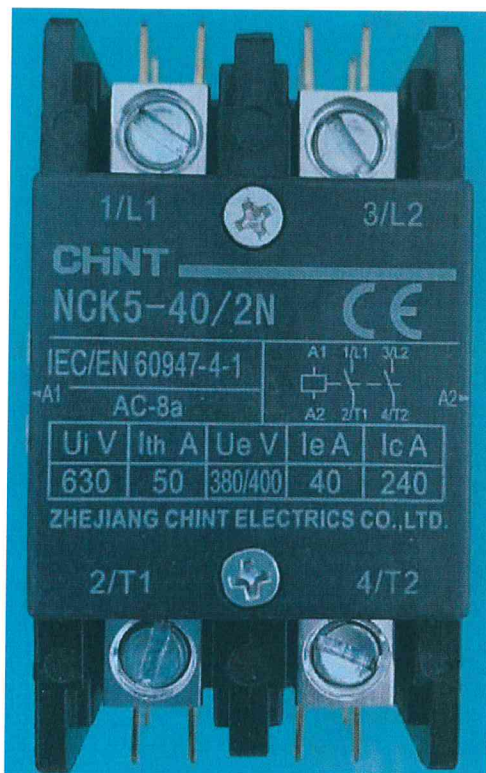
Images of NCK5

Signed for and on behalf of Zhejiang CHINT Electric Co., Ltd. — Chint Industrial Zone, October 29, 2020