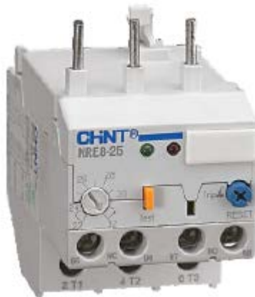
Images of NRE8 series

Signed for and on behalf of Zhejiang CHINT Electrics Co., Ltd. Chint Industrial Zone, June 12, 2019