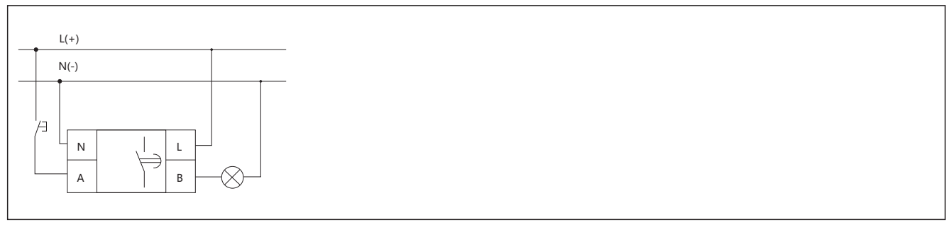
Figure 2 NTE8-□A Relay wiring diagram