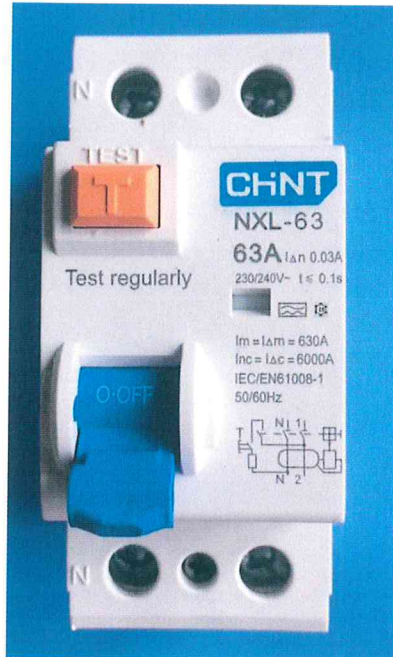
Images of NXL-63