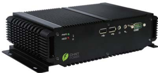
Ultra-Compact Server with Interweb Preloaded